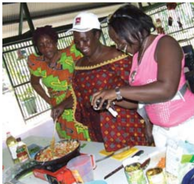
In the picture: Nothing but fun at 'Health Team Workshops'!

All participants have loved the workshops and the food and would like to learn more. More workshops will be planned for the next school holidays. Stay tuned for more information.