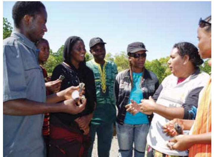
In the picture: FICT participants get a taste of Aboriginal culture with members of the Kalaluk Community

In Sydney I was constantly referring clients to the FICT program that was run by the Services for the Treatment and