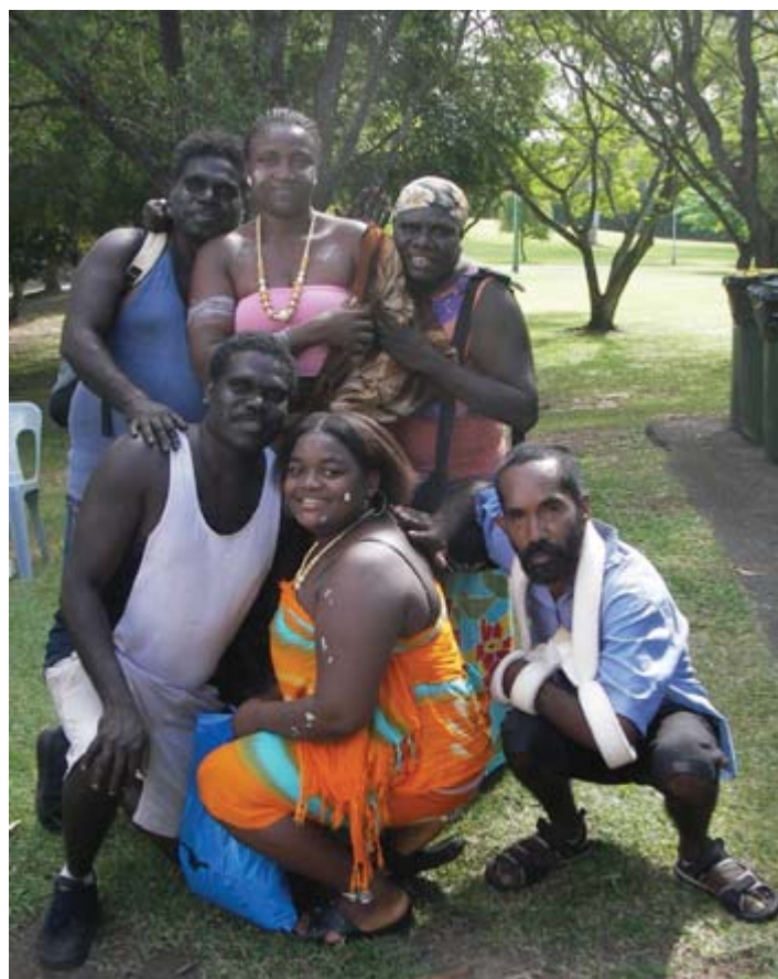
Bridging divides on World Refugee Day 2007.

Let's talk about the experience of refugees and young refugees. For us young refugees we already know some English and we can learn English until we get our degree. But for our parents they can't learn because they are old. When we reach Australia we become like parents because we need to interpret everything for our parents. We need to go with them to Centrelink, hospital and shopping.