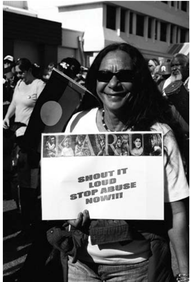
Darwin NAIDOC March – biggest ever.

Many may see the government plans as a land grabbing exercise. Accordingly, there may be nothing new in the "new paternalism" approach. So the NAIDOC celebration theme of 50 years: Looking Forward, Looking Blak may disguise the premonition that the now familiar history of dispossession may well be repeating itself. Please no... Not there again.